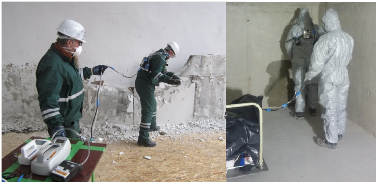
Figure 2: Workers in Romania and Poland performing various works involving materials with MNMs, with simultaneous measurement of the NP concentrations in air.

One of the integral parts of project was to test Scaffold's risk management model in real work with manufactured nanomaterials (MNM) in five Industrial Use Cases (IUC) in real companies for different steps of the life cycle of construction products. After the implementation, an external audit was carried out in each of the company. This allowed to check and improve the versatility of solutions proposed by the Scaffold project. In addition during the audits a monitoring of the presence of nanoparticles was made through the above selected processes for case studies. It allowed to check if the assumptions of exposition for MNMs obtained during the pilot works in the previous work packages were appropriate for the real work with MNMs. The results of the audits is used not only for companies in the successful implementation of the new system, but also served in the further improvement of the developed risk management system.