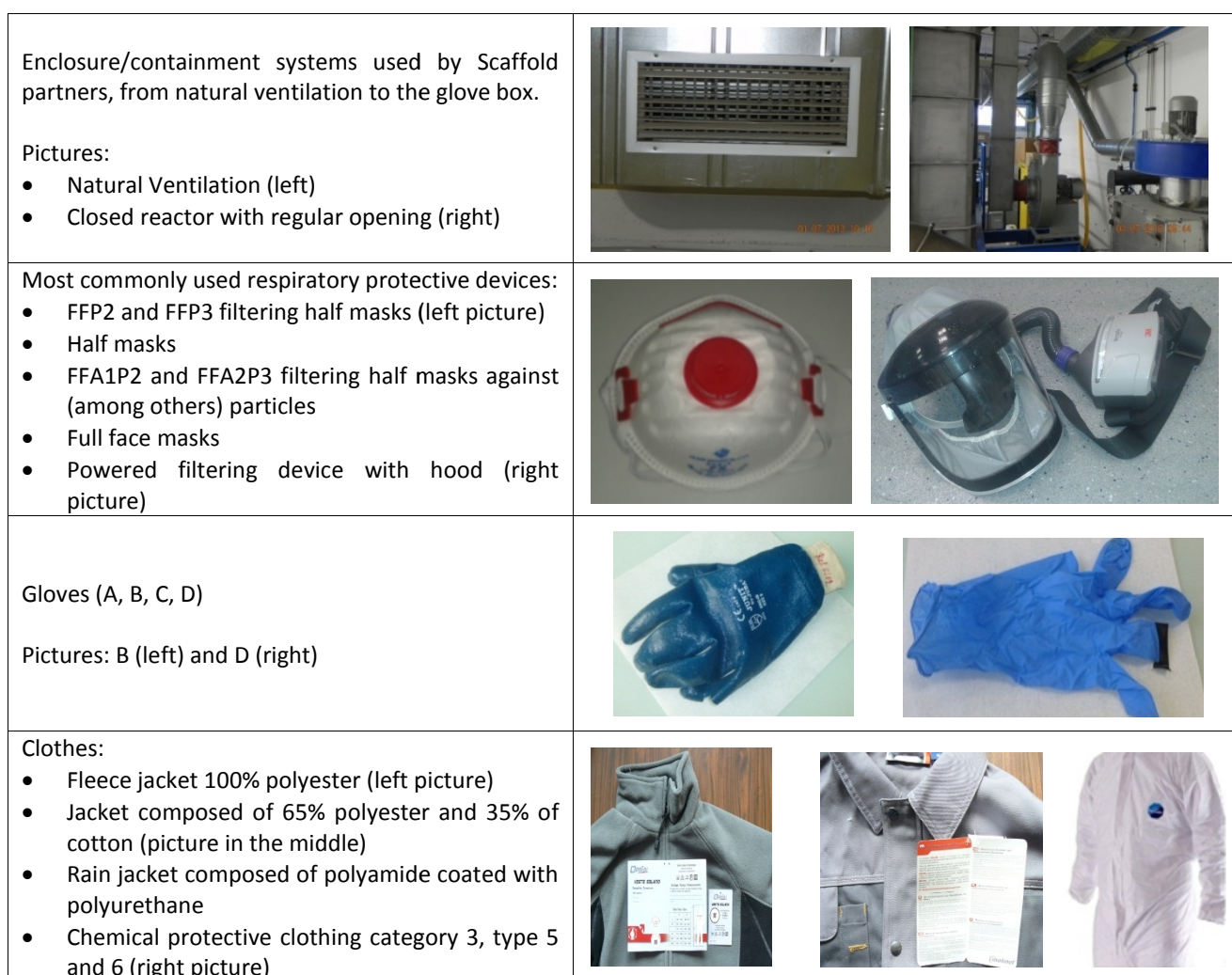
Table 3: Examples of protective devices investigated

The observation of PPEs involved in real scenarios at industrial partners' workplace showed that the current gloves, masks and Tyvek clothes are efficient towards NPs incorporated in a material at realistic concentrations (between 0,4 and 1,7%). Whether in powder form (synthesis of NPs, manufacturing of the mortar) or in solid state (mortar with water, applying on a wall) or in sol-gel state (liquid mortar), we never